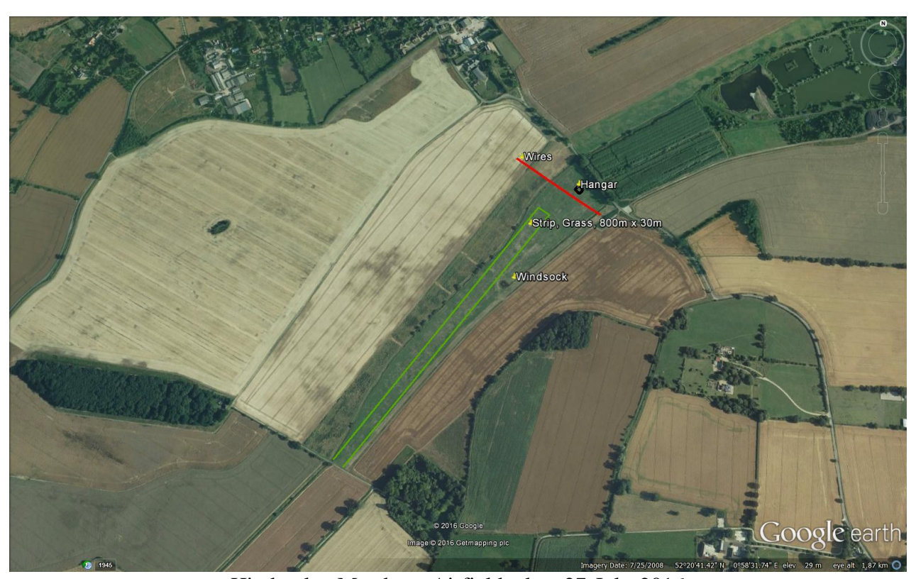
Hinderclay Meadows Airfield taken 27-July-2016

Hinderclay Meadows Airfield School Road Hinderclay Suffolk IP22 1HH